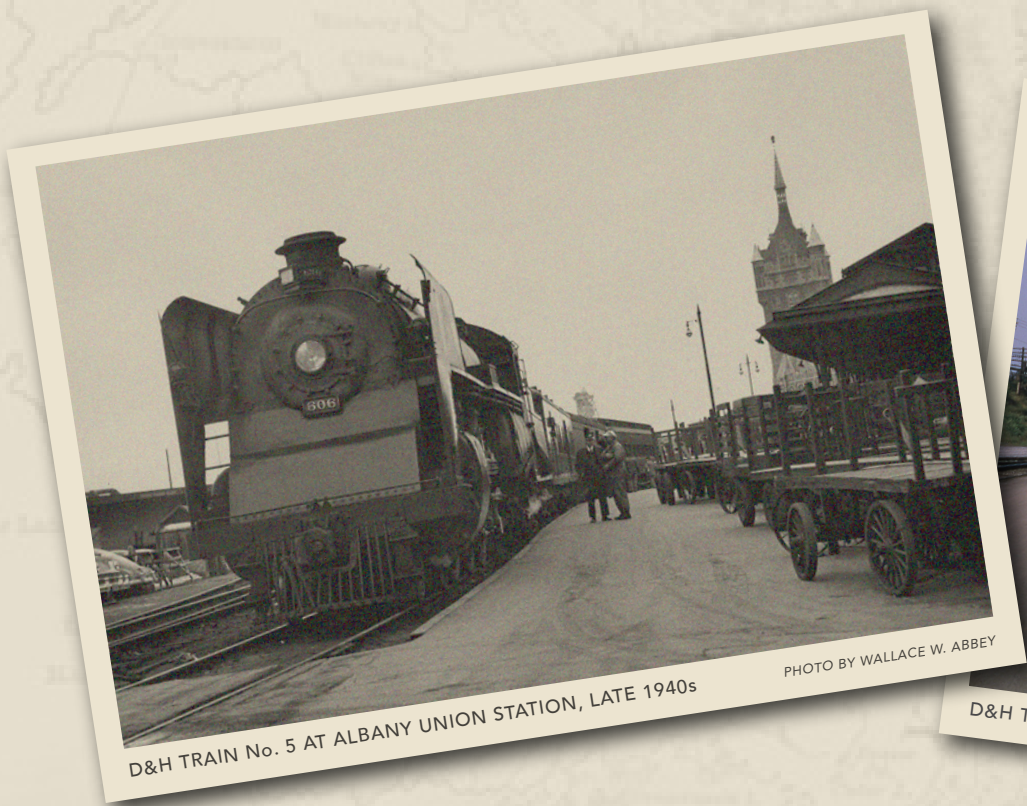
D&H TRAIN No. 5 AT ALBANY UNION STATION, LATE 1940s