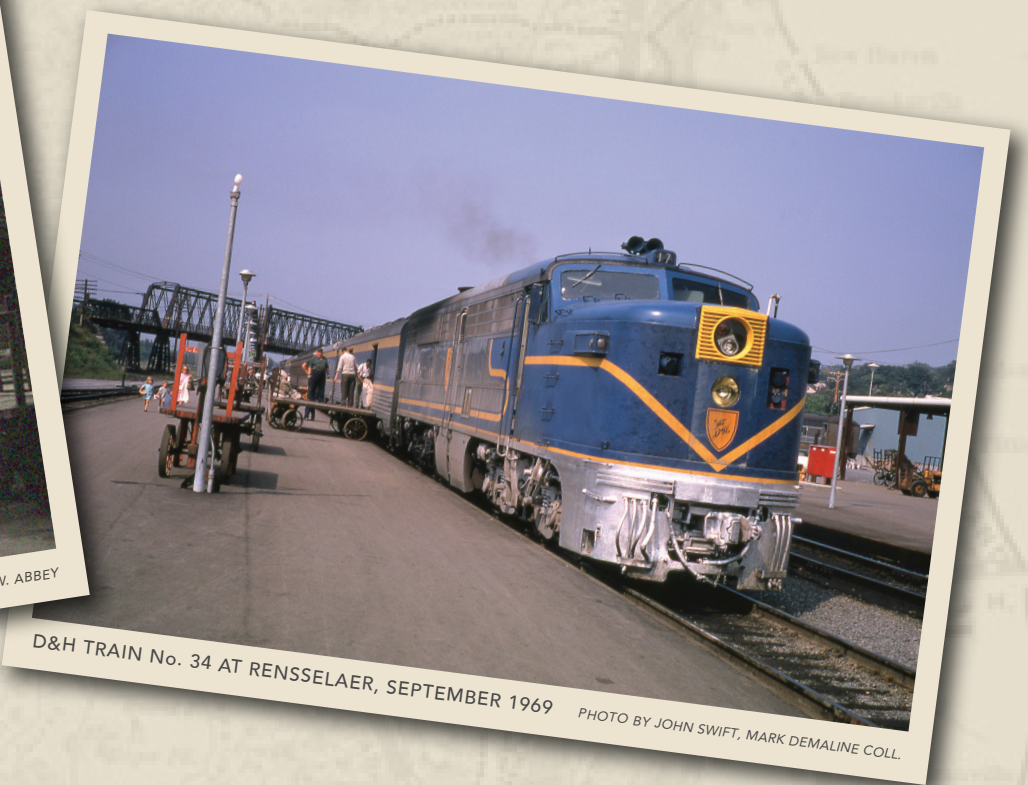
D&H TRAIN No. 34 AT RENSSELAER, SEPTEMBER 1969